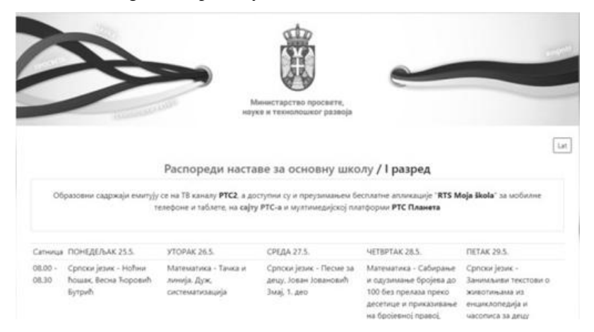
Fig. 3. Website of the Ministry of Education, Science, and Technological Development – Contents and details on lectures

The next Figure 3. is one screenshot from website of the Ministry of Education, Science and Technological Development and it shows a detailed class schedule for the first grade of primary school from March 23<sup>rd</sup> to March 27, 2020.