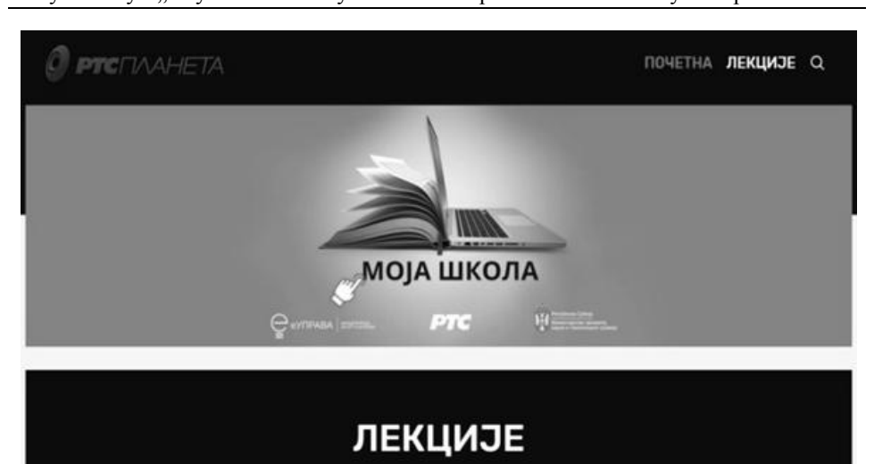
Fig. 6. Multimedia website https://mojaskola.rtsplaneta.rs with teaching materials

Ranđelović, B., Karalić, E., Đukić, D.: The Digitalization of the Learning Process ... Научни скуп "Наука и настава у васпитно-образовном контексту" • стр. 203–2016