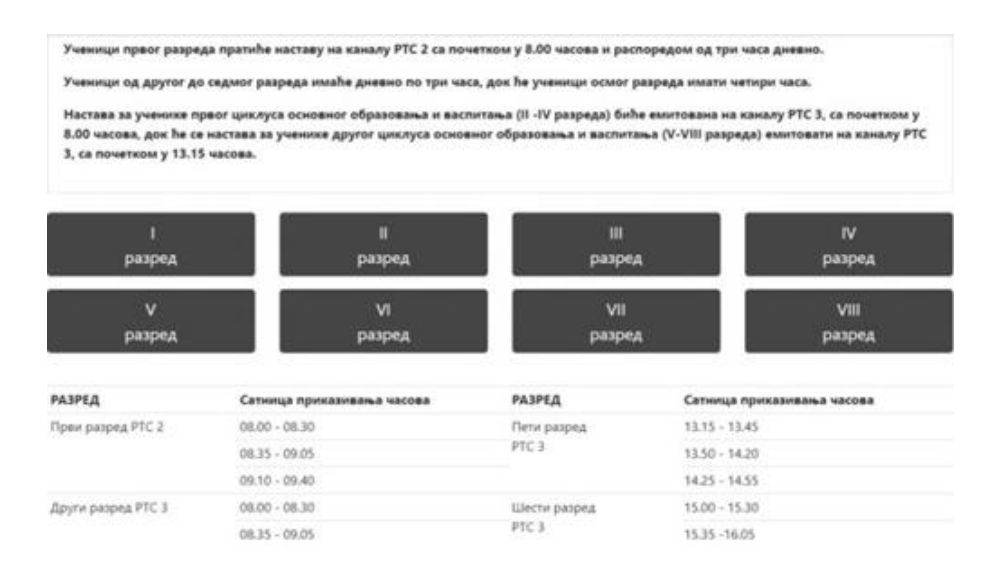
Fig.2. Website with class schedule and timetable

Therefore, all students, teachers and parents were continuously informed about each segment of teaching, which was covered by educational content on state television. The following figure is from the https://www.rasporednastave.gov.rs/website (see Figure 2) where a schedule of broadcasting educational content for primary and secondary school students on TV channels RTS 2 and RTS 3 was publicly available.