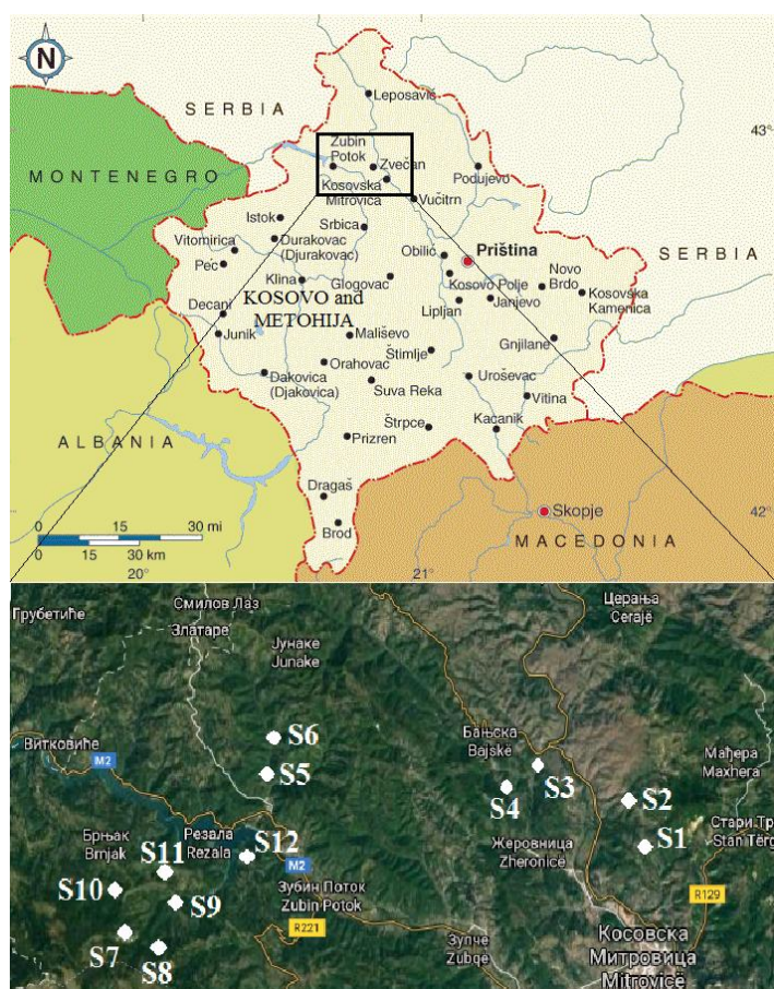
Figure 1. Map of the study area.

The study area belongs to moderately continental climate with cold winter and moderately warm summers. The edges of mountains and valleys between 1000 and 1500 meters of height have sub-mountainous climate (Ivanović et al., 2016). An average amount of precipitation is more than 700 mm and increased with altitude. The measured precipitation in the nearest town Kosovska Mitrovica (510 m a.s.l.) was 657.6 mm and 535.7 mm during 2017 and 2018, respectively (Hydrometeorological Yearbook of Kosovo, 2017-2018).